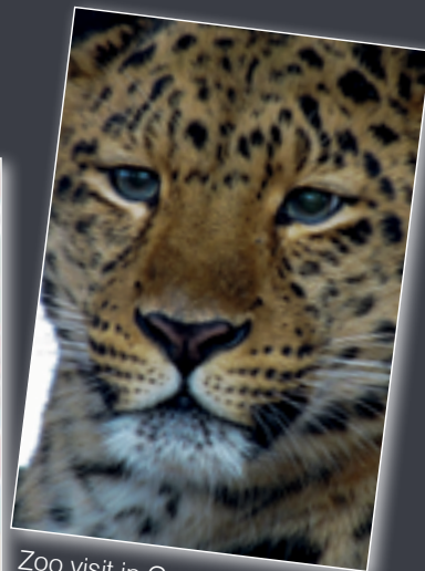
Zoo visit in Gaziantep (Turkey)