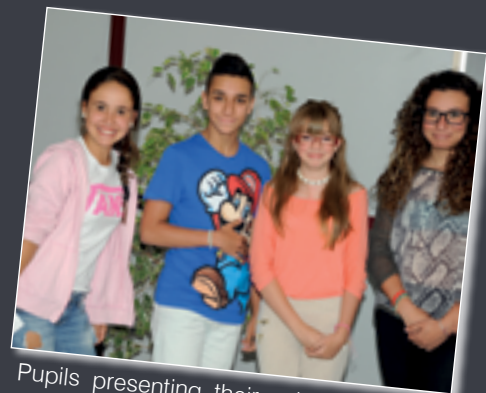
Pupils presenting their self-made video about their memories during the project (Los Realejos / Spain)