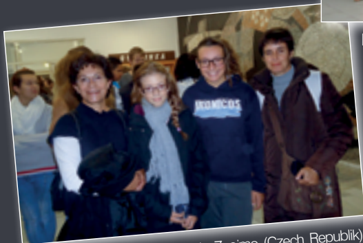
Meeting in the entrance area in Znojmo (Czech Republic)