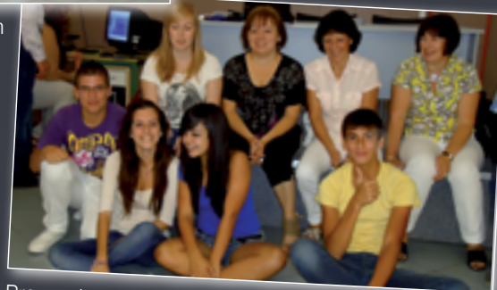
Preparatory visit in Los Realejos / Spain