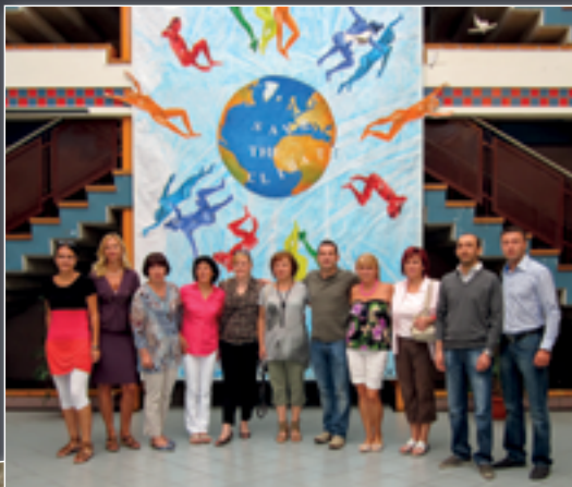
Meeting of participants in the partner school in Spain