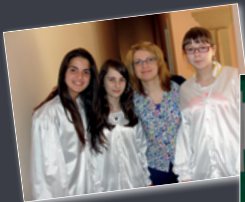
Final meeting in Los Realejos (Spain)