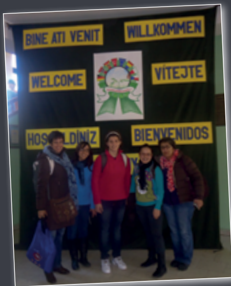
Our project was a cross roads of different cultures