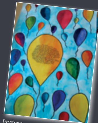
Poster created by students during the meeting (Czech Republic)