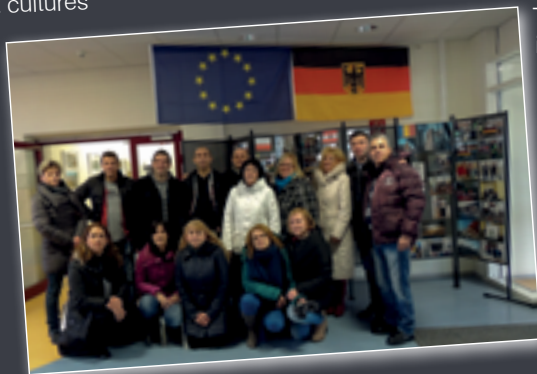
Teachers participating in the project (Torgau/Germany)