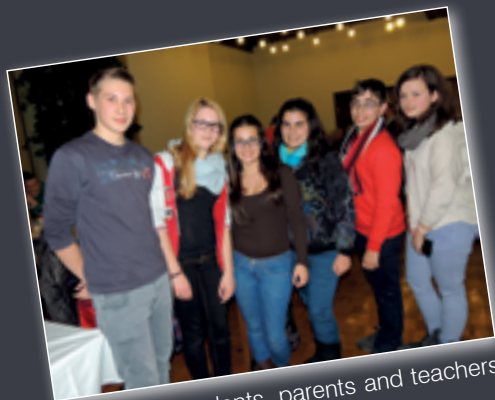
Meeting of students, parents and teachers in Torgau (Germany)